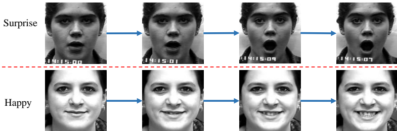
Fig. 2. Expression evolving process from non-peak expression to peak expression.

the detailed changes of face features (e.g., mouth corner radian and wrinkles) can be quite difficult to predict. We avoid this problem by focusing on the high-level feature representation of the facial expressions, which is both more abstract and directly related to facial expression recognition. In particular, the proposed PPDN optimizes the tasks of 1) feature transformation from non-peak to peak expression and 2) recognition of facial expressions in a unified manner. It is, in fact, a general approach, applicable to many other recognition tasks (e.g. face recognition) by proper definition of peak and non-peak samples (e.g. frontal and profile faces). By implicitly learning the evolution from hard poses (e.g., profile faces) to easy poses (e.g., near-frontal faces), it can improve the recognition accuracy of prior solutions to these problems, making them more robust to pose variation.