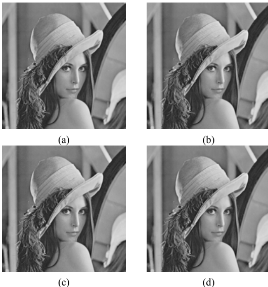
Fig.3. a) The original image , watermarked image b) WQM, c) WQM-R, and d) WQM- \theta